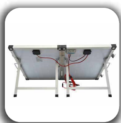
— product details —