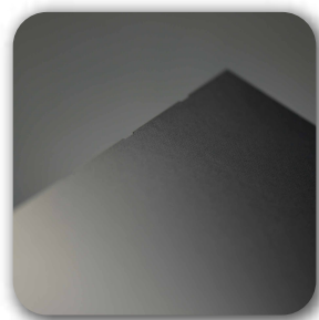
— PCB Material —